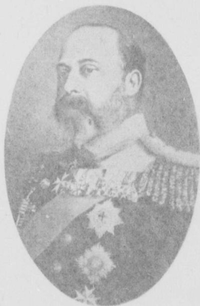
EDWARD VII King and Emperor