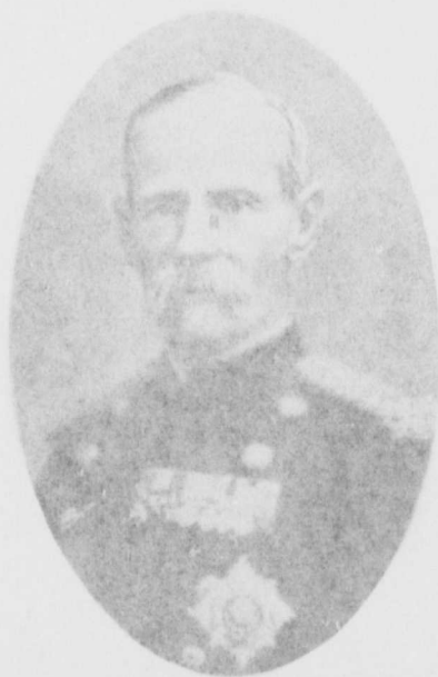
FIELD MARSHAL EARL ROBERTS V. C., K. P., G. C. B., G. C. S. I., G. C. I. E.