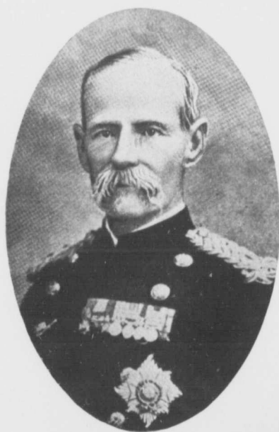
FIELD MARSHAL EARL ROBERTS V. C., K. P., G. C. B., G. C. S. I., G. C. I. E.