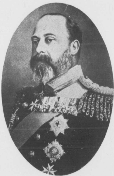
EDWARD VII King and Emperor