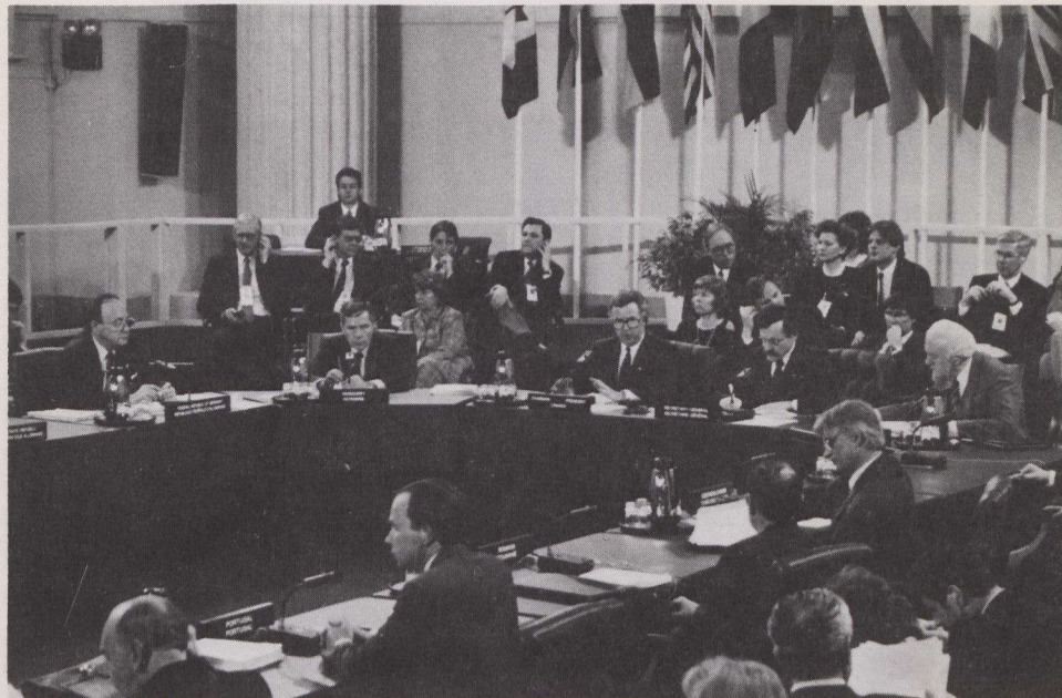
NATO and WTO foreign ministers listening to chairperson Joe Clark (centre) at the Open Skies Conference.

5. Should there be restrictions other than for air safety?