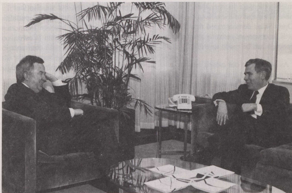
The Right Honourable Joe Clark, Secretary of State for External Affairs (left), with Hungarian Foreign Minister Gyula Horn during talks at the Open Skies Conference held in Ottawa from February 12 to 27. Hungary will host the second stage of Open Skies negotiations in Budapest from April 23 to May 12.

security framework should be the reduction of military forces to the lowest possible level consistent with national security requirements.