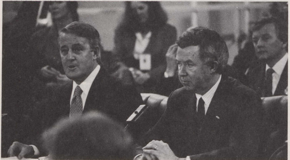
Prime Minister Brian Mulroney (left) with Secretary of State for External Affairs Joe Clark at the Open Skies Conference.

Canada is also ready to play its part in building a new international order. For almost half a century there has been