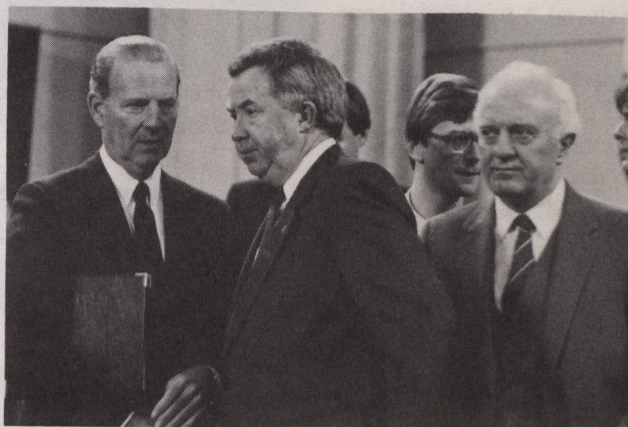
Secretary of State for External Affairs Joe Clark (centre) with American Secretary of State James Baker (right) and Soviet Foreign Minister Eduard Shevardnadze (left) at the Open Skies Conference held in Ottawa from February 12 to 27, 1990.