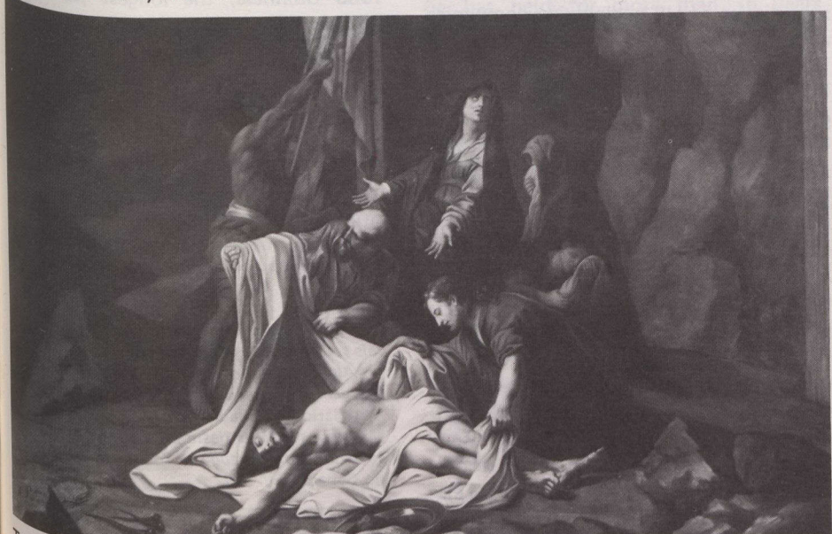
The Deposition from the Cross, oil on canvas, painted by Antoine Plamondon in 1839.

After their rejection by the original client, the paintings in the suite suffered indignities and even a few more triumphs. They eventually disappeared, and the six surviving works were only rediscovered in an attic in the 1930s. A series of contemporary documents enables the public to visualize the eight lost episodes and to follow the suite's unusual fate. Didactic panels and photographic material also provides a detailed study of the European works which inspired Antoine Plamondon, including paintings by Cardi, Mignard, Jouvenet, Stella and Titien.