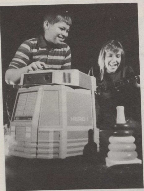
Children will learn about robotics with Hero the robot in the communications workshop.

computers while "Comets, Volcanoes and the Sudbury Basin" explores geological theories relating to the formation of the Sudbury Basin.