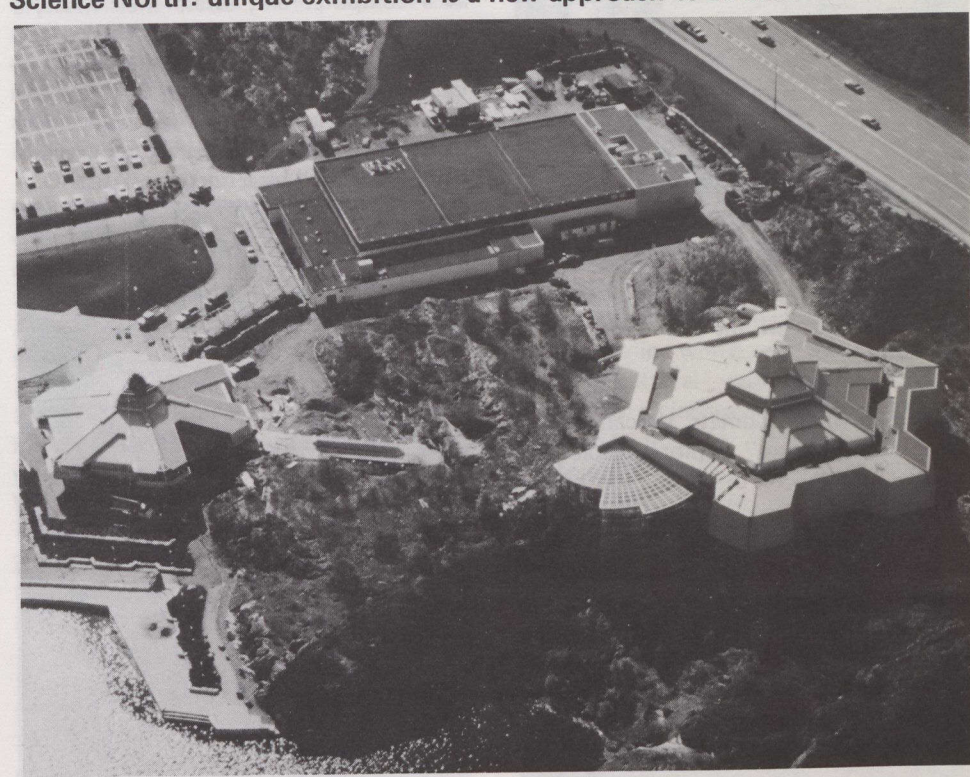
The larger snowflake building (right) houses three exhibit floors and a rock cavern theatre.

Science North: unique exhibition is a new approach to science