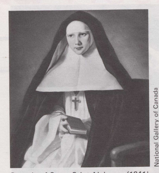
Portrait of Soeur Saint-Alphonse (1841). of the finest religious series ever produced in North America In colour alone

In 1961, the Montreal Museum of Fine Arts acquired the six surviving canvases of the most important religious commission the artist ever received: the 14-station Way of the Cross suite for Notre-Dame Church in Montreal. This commission, awarded in 1836, was a great compliment the Young artist, who had been apprento Joseph Légaré and had studied in Europe in the 1820s before setting up Practice in Quebec City. The masterful of 14 paintings that Antoine Plamondon produced over three years for Notre Dame was rejected by the Church on liturgical grounds, but was nonethehailed by contemporary critics as a tiumph, and may still be considered one