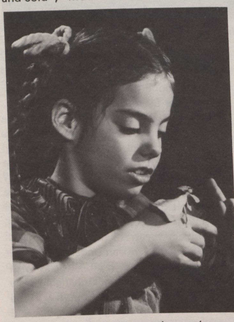
A live insect zoo will contain exotic specimens like this Javanese leaf insect. The insect zoo will contain many northern specimens as well as part of the life sciences exhibit area at Science North.

The focal point of the main exhibit area will be the fast-paced, forge centre show. A working forge will demonstrate the principles of forging, smelting, casting and alloying with demonstrations based on themes such as "up and down", "hot and cold", "motion and mass".