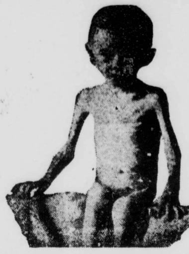
(A Photograph Direct from the War-Stricken Area)