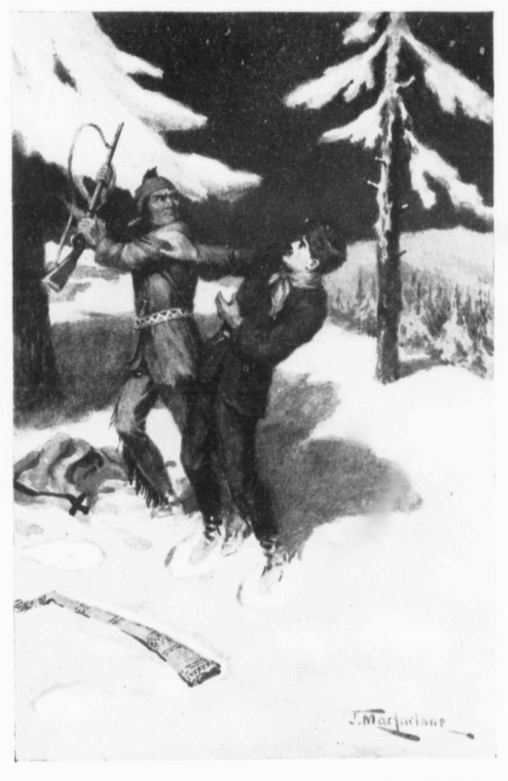
THE RIFLE WAS WRENCHED QUICKLY OUT OF HIS HANDS. [See page 26.