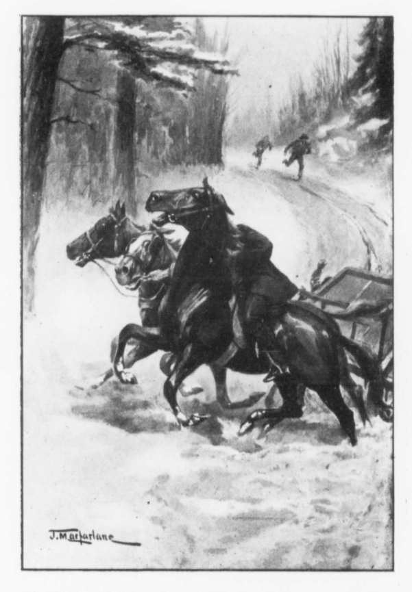
HE FORCED THE RUNAWAYS INTO THE SNOW AND STOPPED THEM,