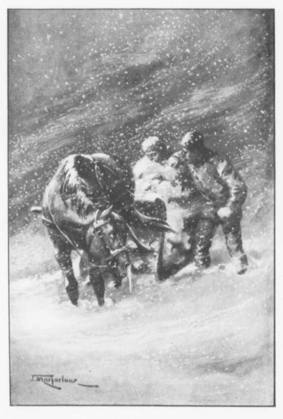
'WAKE UP, PREACHER! ARE YOU DEAD OR ALIVE?'