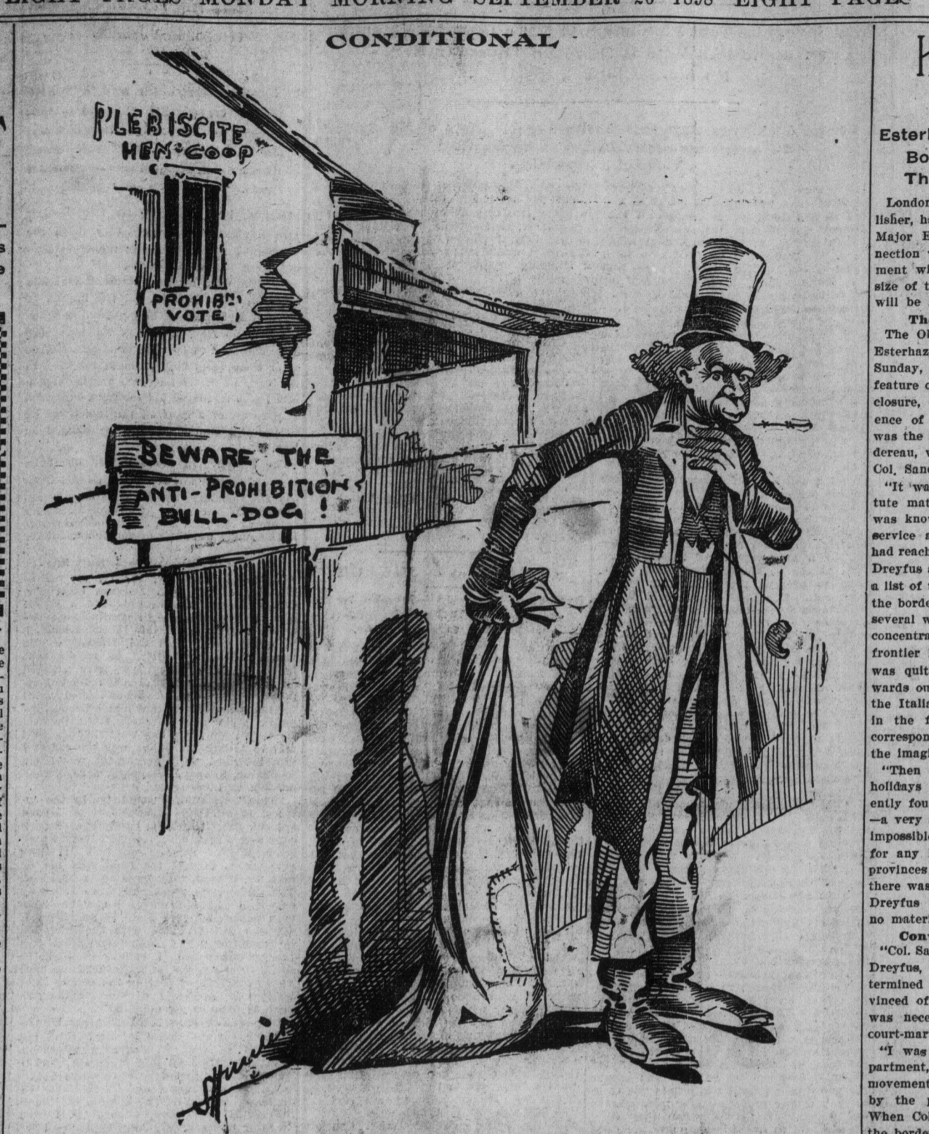
DEACON LAURIER: If de hole am big enough, an' de dawg am not too large an' demonstrative, I got ter mind to go in fo' dat Prohibition chick.

CIBBONS & CO. STOCK BROKERS. LEADER LANE.