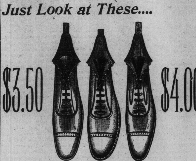
ASTORIA | MANHATTAN | PENNSY.