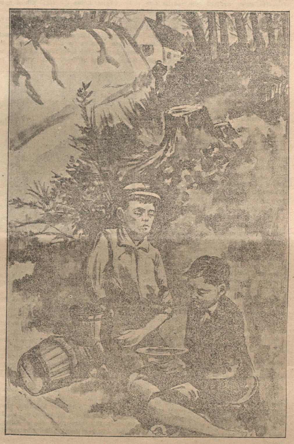
A DOLLAR AND FIFTY-THREE CENTS, HE SAID, SLOWLY.

'Come, Jimmy,' he said, at last; 'you may's well git up. 'Tain't no use frettin'. We might have knowed how 'twould come out. Things always end this way with us.'