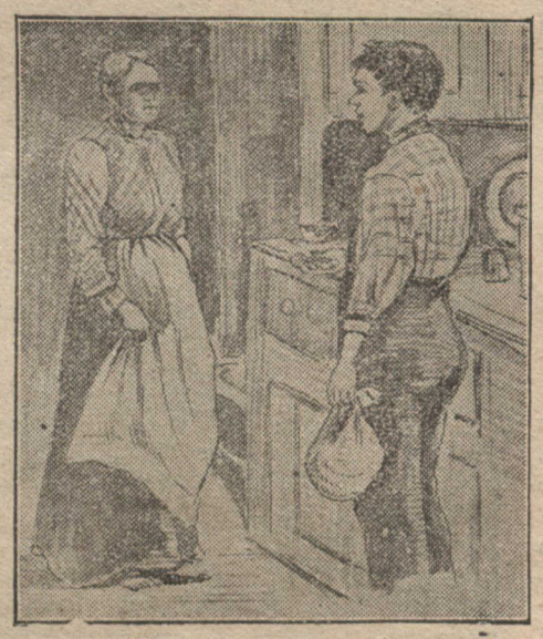
'Ma'! he suddenly exclaimed; 'you are still'

He was attending the night school now, but somehow it did not give him the satisfaction he had anticipated. Over and over he told himself that he was doing the only thing possible, that he was doing it as much for their sake as for his own, that if he went back to the flats, there would be no future for any of them. But it was of no