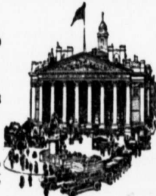
Head Office: Royal Exchange, London

Correspondence invited from responsible gentlemen in un- represented districts re fire and casualty agencies