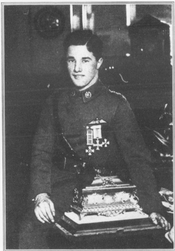
CAPTAIN ALBERT BALL

The first great English Ace, killed on May 7, 1917, in his twentieth year, after shooting down 43 German planes.