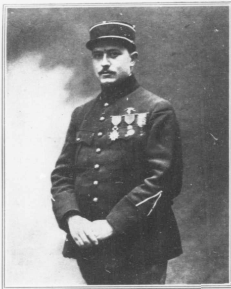
LIEUTENANT RENÉ DORME

called "the unpuncturable," who disappeared May 25, 1917, with a record of 23.