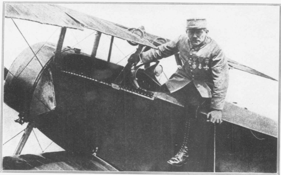
LIEUTENANT CHARLES NUNGESSER

Famous French Ace, seventeen times wounded, with a record of 38