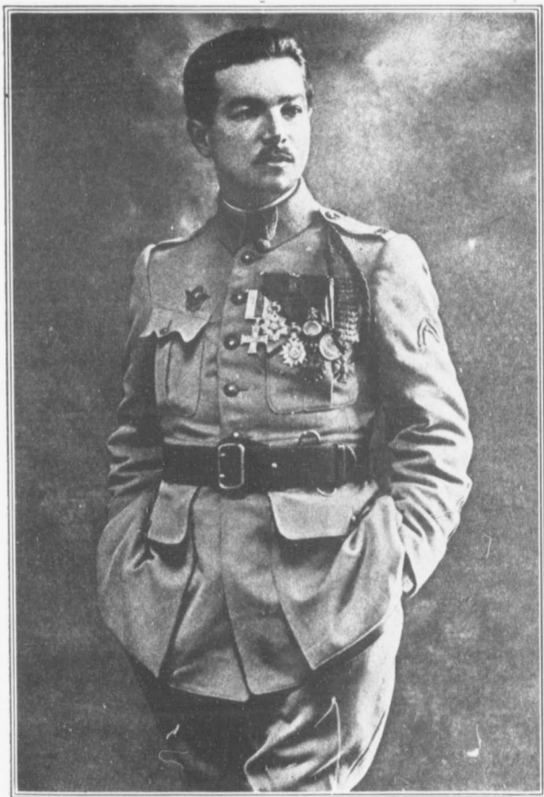
LIEUTENANT RENÉ FONCK

The world's most polished air duelist, who has shot down more than 59 enemy aviators, including six in one day.