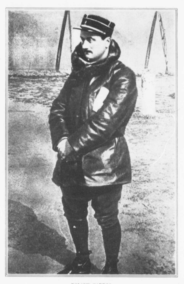
{\bf ROLAND~GARROS} Most famous before-the-war French a viator. Inventor of shooting through the propeller.