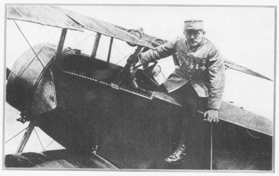
LIEUTENANT CHARLES NUNGESSER Famous French Ace, seventeen times wounded, with a record of 38