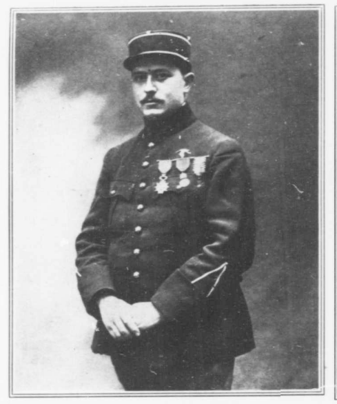
LIEUTENANT RENÉ DORME called "the unpuncturable," who disappeared May 25, 1917, with a record of 23.