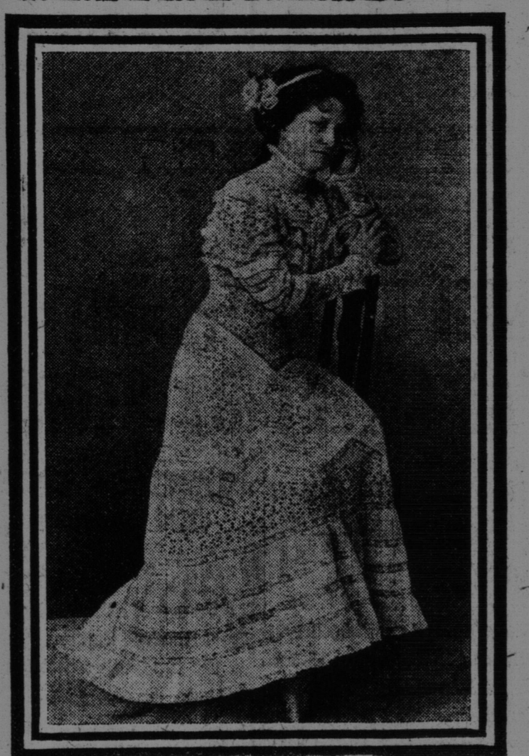
A PATTERNED EFFECT IN EMBROIDERY. Eyelet embroidery insertion was used to make this pretty frock, which gives the effect of expensive allover eyelet work. The insertions are joined in panels, each panel being outlined with narrow Valenciennes lace. The vandyked arrangement of the insertion which encircles the skirt shows how every bit of the material has been used to advantage. The yoke and sleeve caps of embroidery are full of suggestions for the use of fine insertion in combination with lace. A light and graceful look is given to the dress by the flounce of lace and batiste, this flounce being matched by the long sleeves of batiste alternating with the lace insertions.