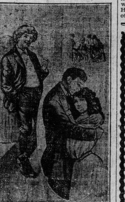
Scene from "The Cow Boy and the Squaw," at the Majestic.