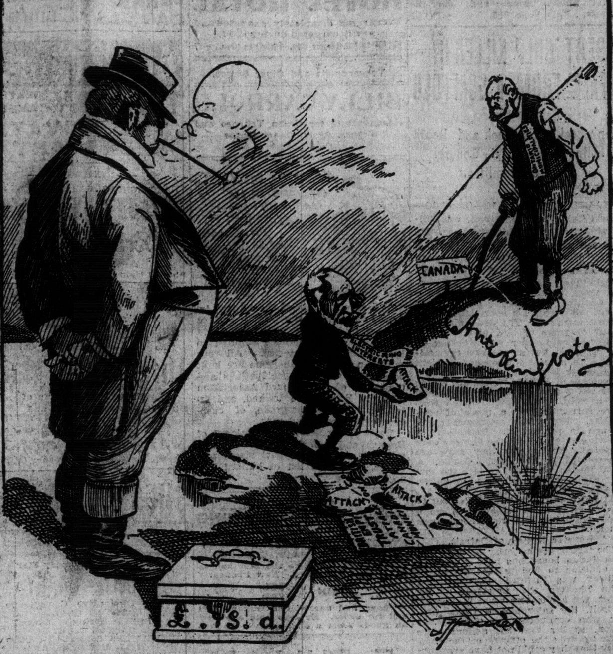
MR. BULL: Say, 'e'd like jolly well to 'it Mr. Ontario, wouldn't 'e?