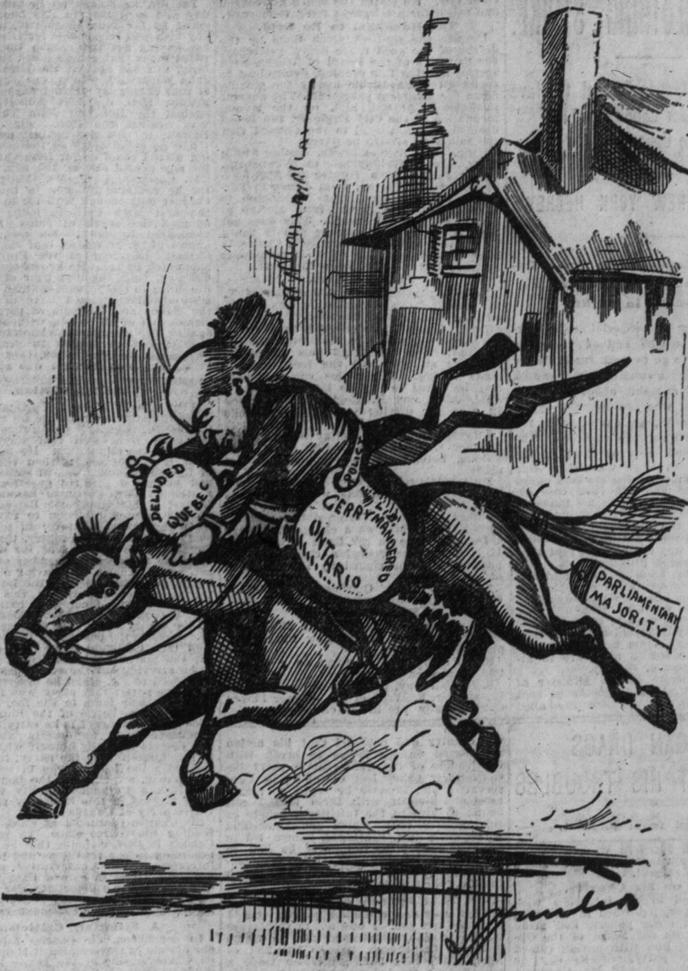
"Each bottle had a curling ear, Thro' which the belt he drew; And hung a bottle on each side To make his balance true."