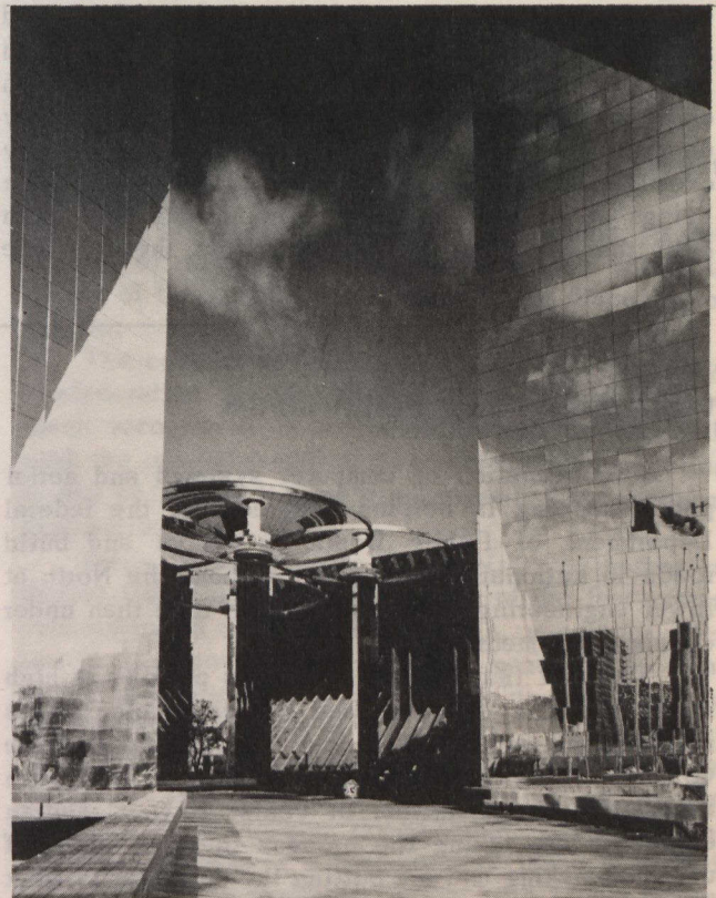
One of the entrances to the courtyard.