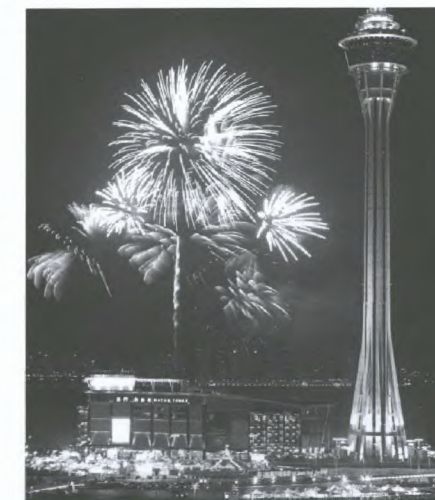
After becoming a Special Administrative Region of China in 1999, Macao enjoys a high degree of autonomy in all matters except national defence and foreign affairs.