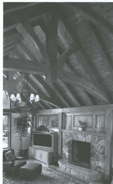
A Normerica timber frame home

The counties surrounding greater Washington, D.C., are some of the wealthiest in the United States. Fast-appreciating property values and low interest rates have provided homeowners in the region with the incentive to renovate their houses or build new custom ones. A Canadian company that specializes in massive handcrafted products has been busy helping.