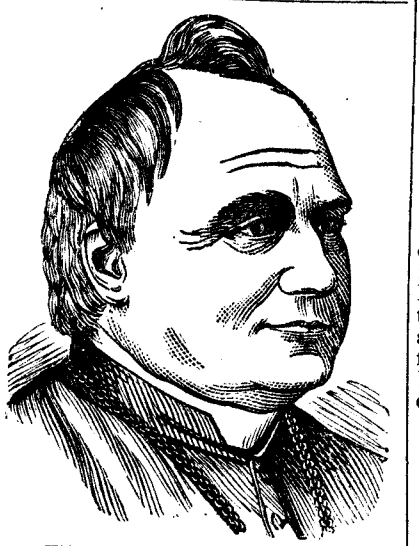
HIS GRACE ARCHBISHOP TACHE.

Today is the patronal Feast of our beloved and deeply revered Archbishop. It is the feast of the great Pontiff, St. Alexander, and on this day, all the Catholics of the Archdiocese love to gather around their spiritual father and offer to him the homage of their love and their hearts congratulations.