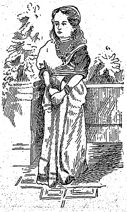
SHE WENT TO SCHOOL.

the great Himalaya mountains in the north of India. The road skirted along the side of a steep hill. Here and there she saw a village surrounded by its narrow terraces of: