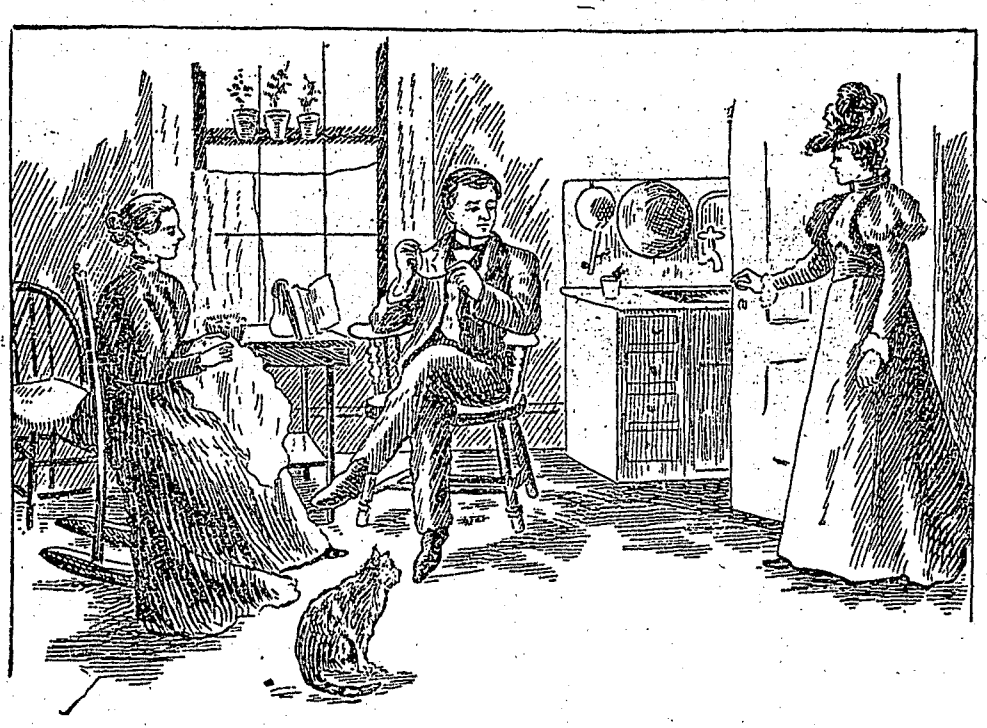
DARNING ONE OF HIS FATHER'S SOCKS.

'I suppose you wouldn't be willing for me to give up my studies, mother?'