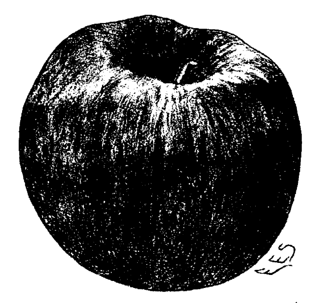
FIG. 84. - KEANR'S SEEDLING APPLE.

"The whole land bought by Drs. Shorb and Springmuhl, except the part