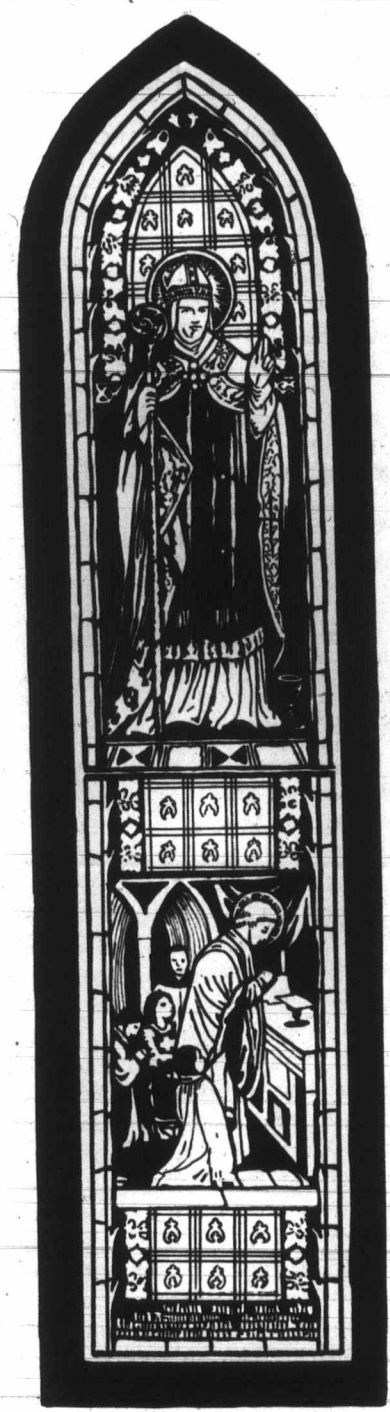
This Window for England

The Cowley Fathers are to be congratulated on the beautiful chapel, does of St. Richard, called variously tached to their House in Westminster, which was dedicated by the