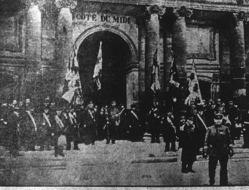
GERMAN FLAGS CAPTURED BY THE FRENCH.