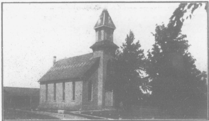
ST. ANDREW'S PRESBYTERIAN CHURCH, NAPIER, ONT.