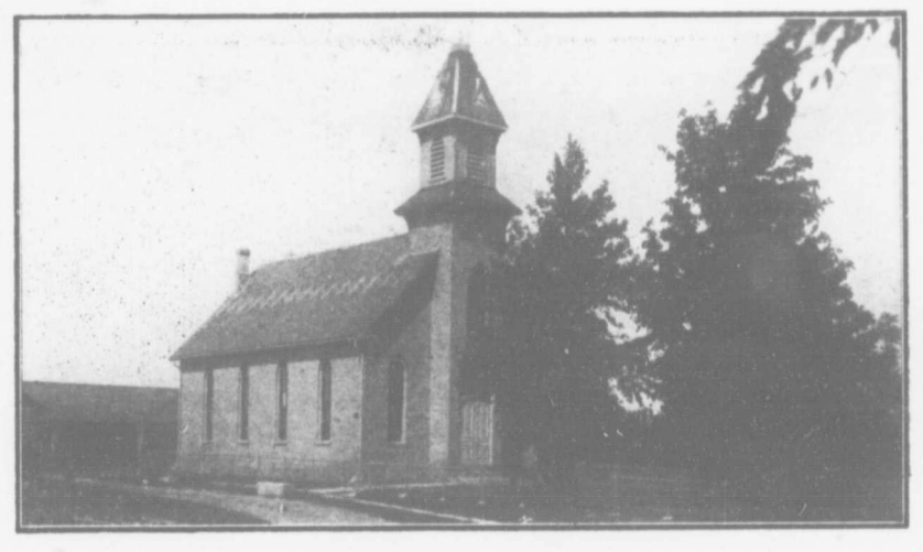
St. Andrew's Presbyterian Church, Napier, Ont. -1887-