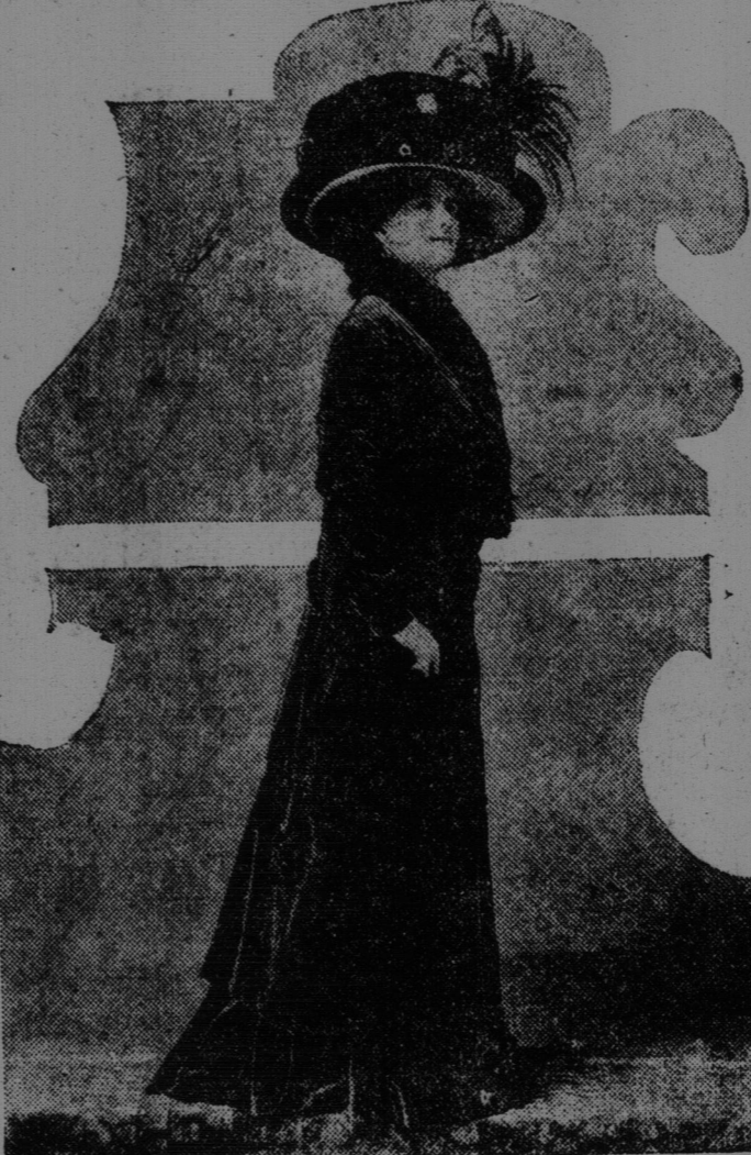
CALLING COSTUME OF BURGUNDY VELVET.

Velvet is the accepted fabric for dressy afternoon wear, but this year's styles are softer in texture and richer in color than anything seen heretofore. The handsome suit is of mirror velvet in a deep burgundy shade, the coat being a Russian smoke model with cord grid around the hips. The hat is of rose-colored felt, faced with burgundy velvet, and with a large, draped crown of the velvet. The accessories are black, and the black touch is repeated by the lynx collar and revers on the coat.