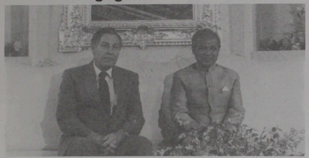
Minister for International Trade James Kelleher is received by Prime Minster, General Prem Tinsulanonda at Government House

During his three-day visit, Mr. Kelleher met with Prime Minister Prem, Foreign Minister and Deputy Prime Minister Siddhi and five Thai Ministers responsible for commerce, industry, oil and gas, transportation, and communications.