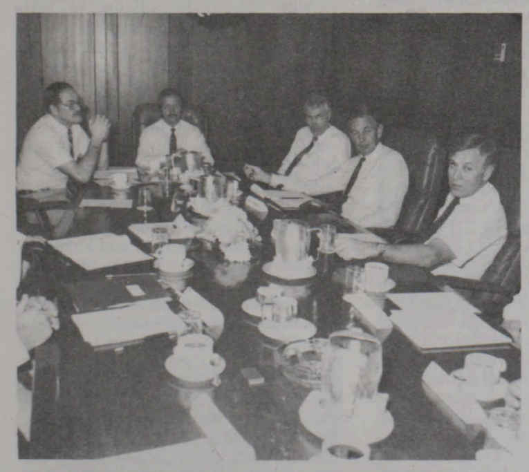
Mr Kelleher reviews regional trade promotion activities with Trade Commissioners from Canada's posts in ASEAN.

In discussions with Prime Minister Prem, Mr. Kelleher emphasized that "the next round of MTN is the best means open to trading nations to turn back the protectionist tide, lower trade barriers, and strengthen the multilateral trading system".