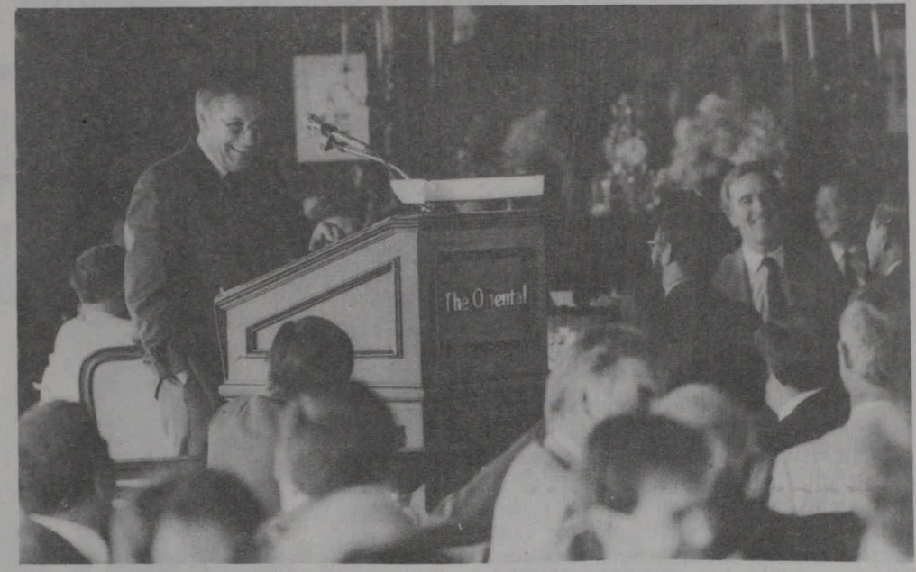
The Honourable James Kelleher, Minister for International Trade addresses guests at a luncheon he hosted in Bangkok on 19 February 1986.

• funding amounting to $300 000 for Walsh Inc. of Montreal to carry out a feasibility study on the construction of an experimental palm oil mill for the Palm Oil Research Institute of Malaysia;