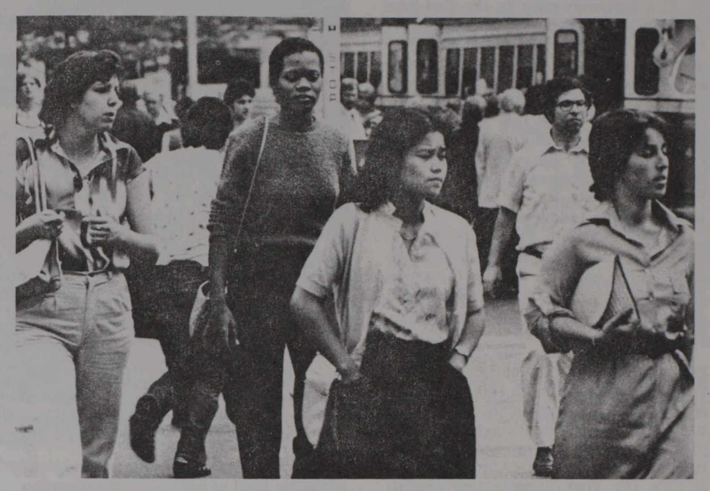
A new country brings new opportunities.

Entrepreneurs are defined as persons who have the intention and ability to establish, purchase, or make a substantial investment in a business venture in Canada. This venture must make a significant contribution to the economy and must result in the creation or maintenance of employment opportunities for one or more Canadian citizens or permanent residents, other than the entrepreneur himself and his dependents. This category is designed to attract experienced business persons whose background is oriented towards the management of small to