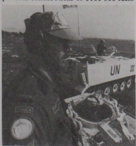
A Canadian patrol member of the UN peacekeeping force in Cyprus.

At the international level, Canada will support the objectives of the United Nations' World Disarmament Campaign by donating $100 000. Canada has made two previous contributions of $100 000 each.