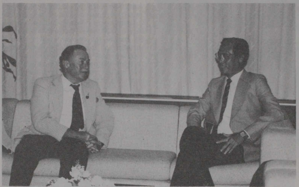
The Honourable Lloyd Crouse confers with First Deputy Prime Minister and Minister of Defence Goh Chok Tong