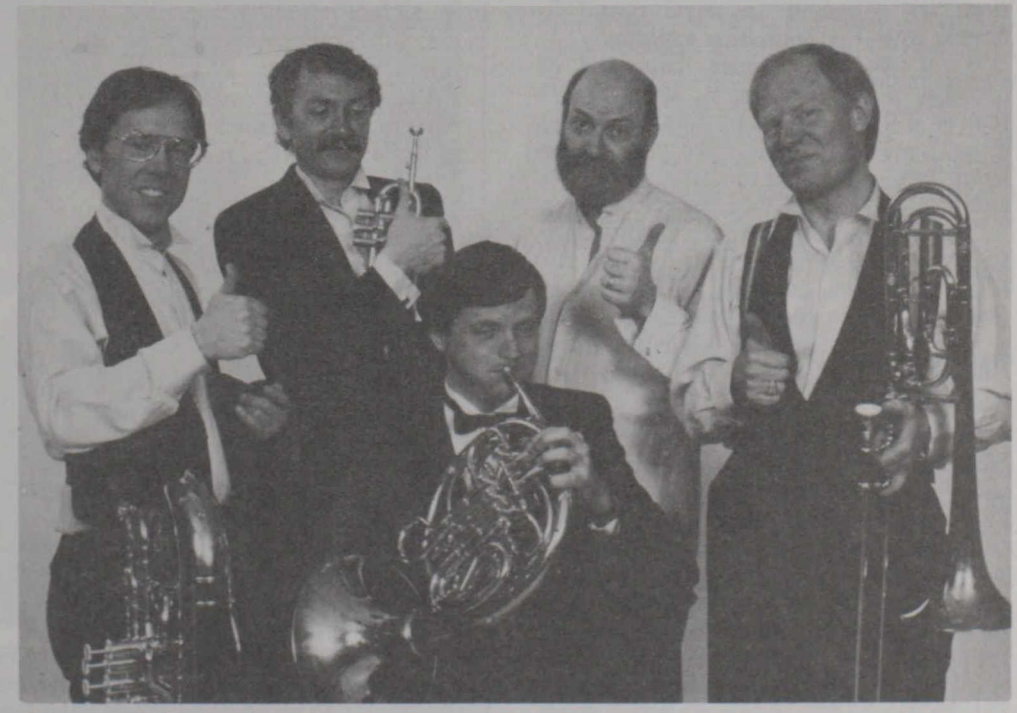
Internationally known Canadian Brass will perform June 9–11 as Singapore's biennial Festival of the Arts.