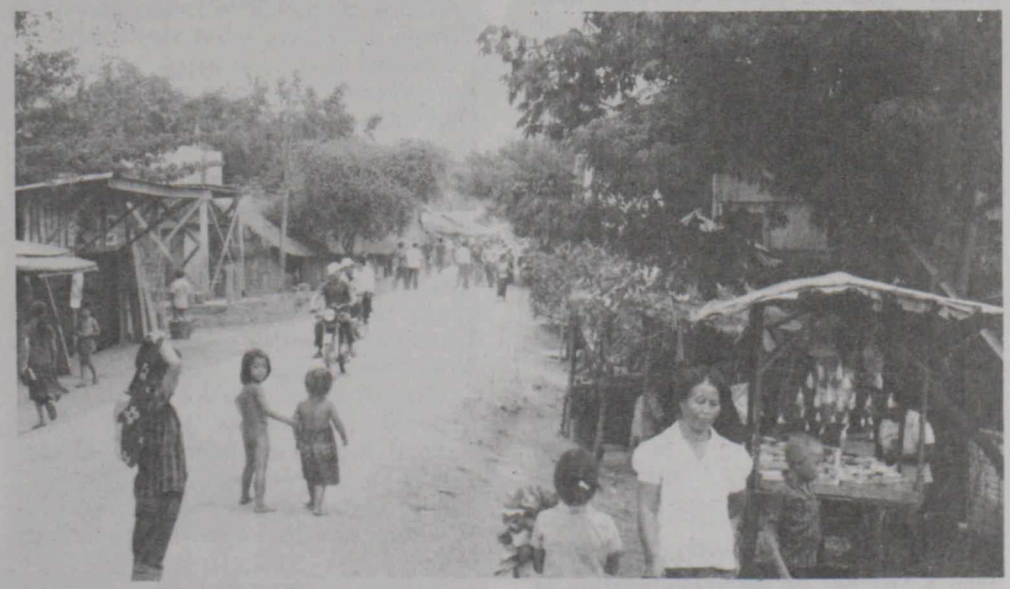
A street scene in Ban Vinai Camp, one of several refugee camps in the ASEAN region where Canadian officials conduct interviews to initiate the resettlement process.

Canada intends to remain a major player in the resolution of the Indochinese problem in Thailand. Through moral and financial support, and the offering of resettlement places when appropriate, Canada expects to contribute its share to the mix of various solutions which will bring the Indochinese "problem" to a just and durable denouement.