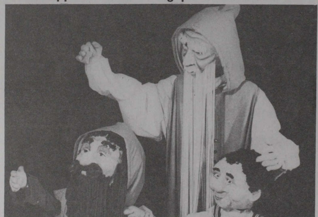
Gandalf the wizard, Thorin leader of the dwarves and Bilbo the hobbit.

Montreal based company, Theatre Sans Fil, enchanted audiences at the Young People's Festival held in Singapore March 2—23, 1986. As one of two foreign companies participating at the Festival, the theatre group presented the famous fantasy tale "The Hobbit". This stage adaption uses giant puppets and specially commissioned music and lighting to recreate the magic atmosphere of this