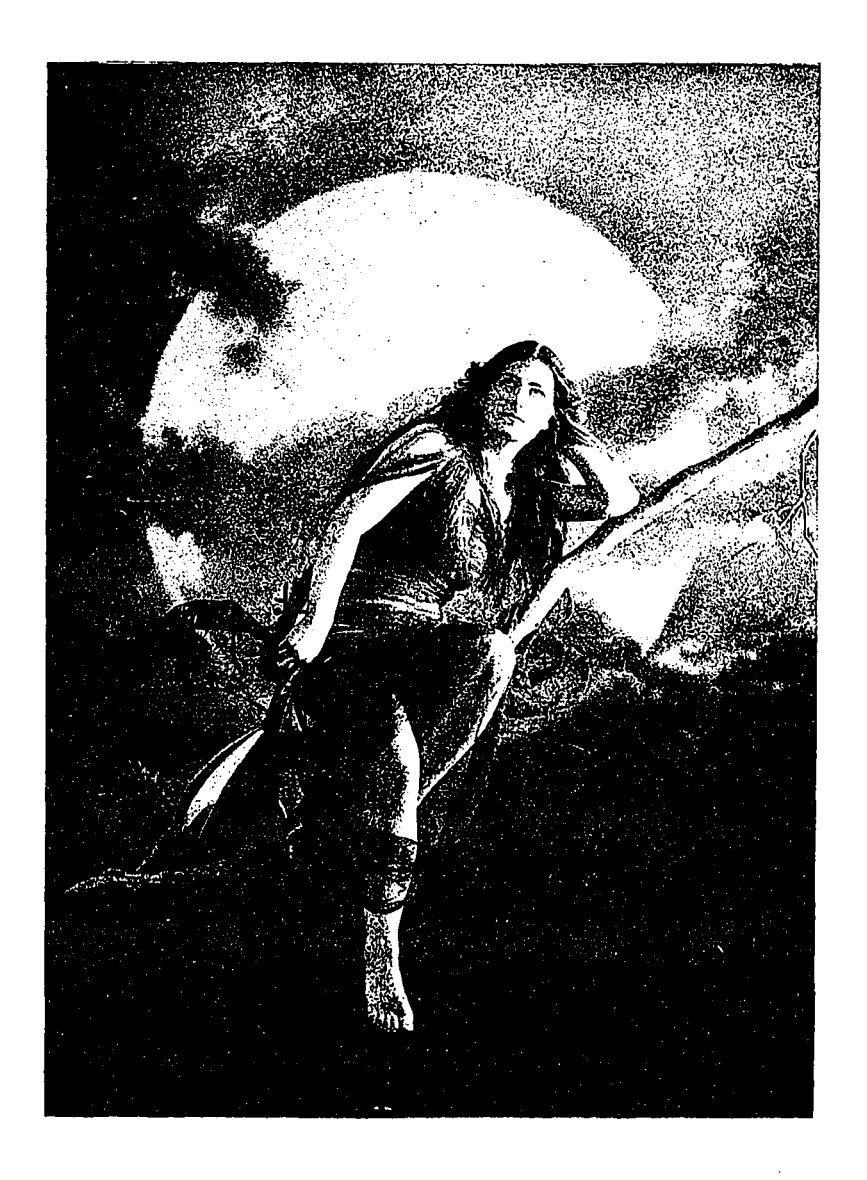
QUEEN OF THE NIGHT.

A Gem from the P. A. of A. Convention.