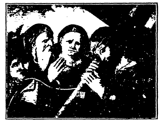
Jesus and Simon of Cyrene

38. Superscription, etc.; the writing giving the name and crime of the person crucified. It was done on a white tablet, hung round the neck of the criminal. and then fastened to the cross. Greek ... Latin . . Hebrew : the three great languages of the world of that time: an unconscious prophecy