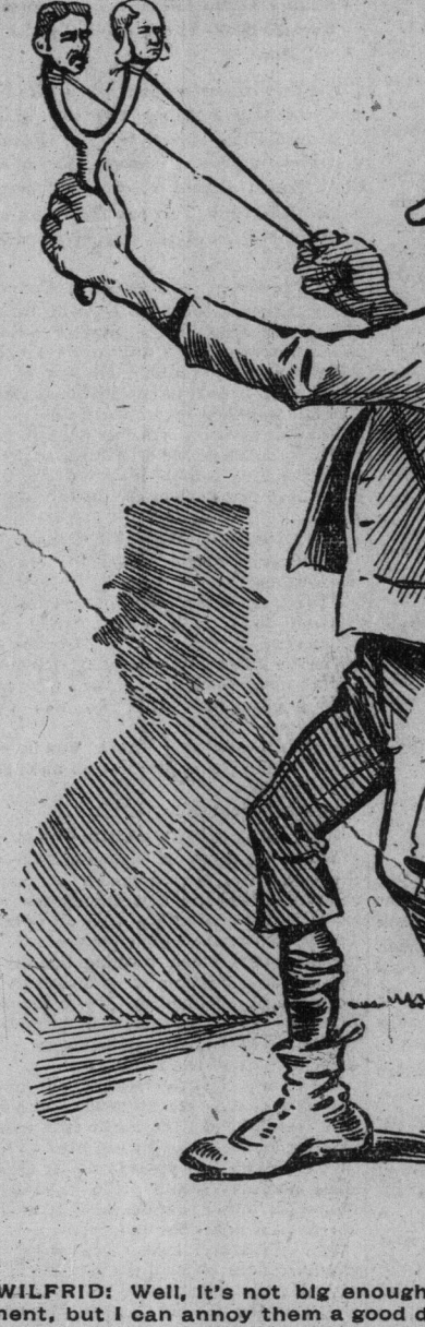
WILFRID: Well, it's not big enough to seriously injure the Government, but I can annoy them a good deal with it.

This information elicited by a question in the Commons—Correspondence with the Colonial Office Shows That 300,000 Cattle Landed Only Eight Weeks "Suspect"—The Constabular Decision.