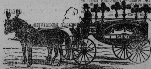
(Cut of our new Horses.)