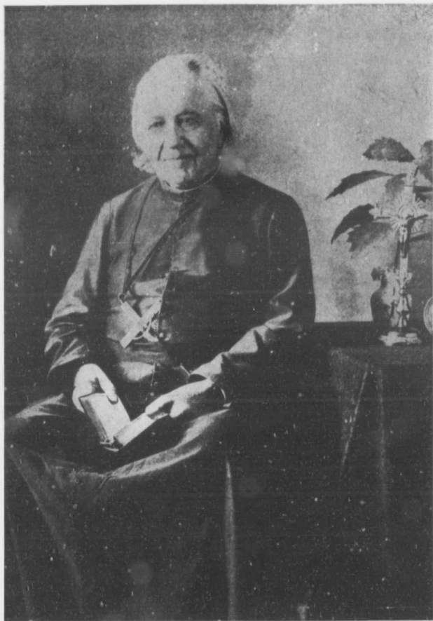
Albert Lacombe D. M. C.