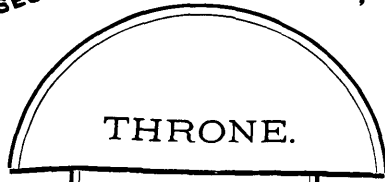
DIAGRAM OF THE SENATE CHAMBER. 5TH SESSION, 8TH PARLIAMENT, 1900.