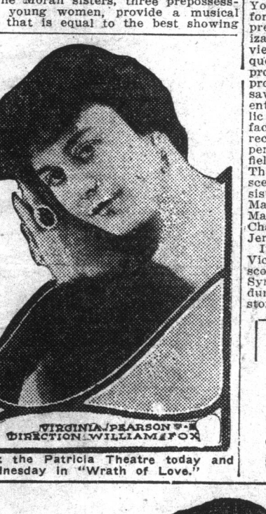
At the Patricia Theatre today and Wednesday in "Wrath of Love."

PATRICIA Two High-Class Vaudeville Acts at the Patricia This Week. Not in months have theatre patrons been afforded the opportunity of seeing two such high-class vaudeville acts as are being presented this week at the Patricia Theatre.