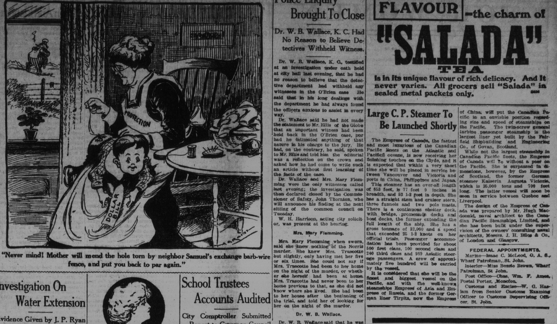
er will mend the hole torn by neighbor Samuel's exchange barb-wire fence, and put you back to par again."