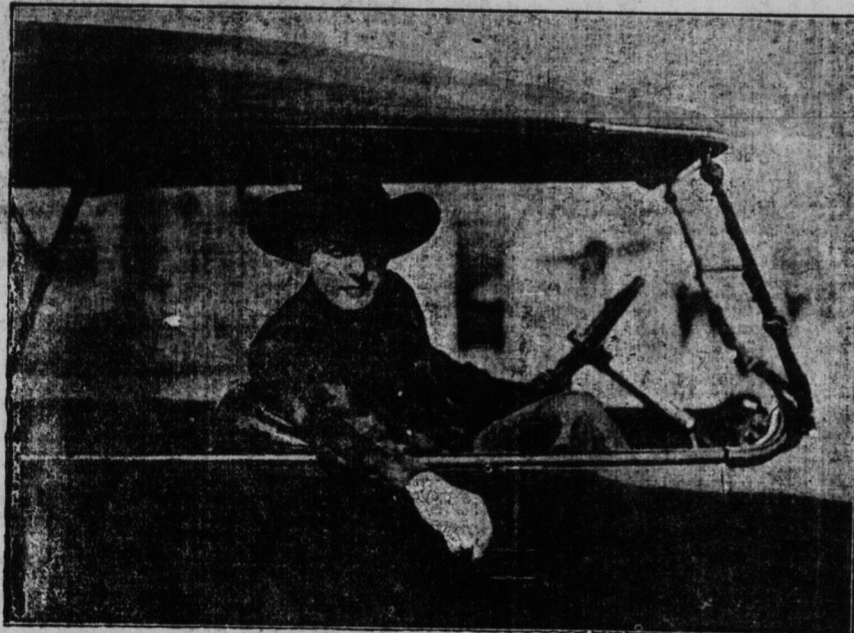
Harry Carey, popular Universal Western Movie Star, drives a big seven-passenger Studebaker, similar to the one offered as first prize in The Standard's Auto and Movie Star Contest. Here he is at the wheel of his Studebaker. Two of the prizes to be given away in the Standard's big Auto and Movie Star Contest are Opportunities to become Movie Stars with The Universal Film Company of Universal City, California.

The automobiles which will be given away in connection with The Standard's big $15,000 Prize Contest will not be driven around the country or city by members of the Contest Department or any other persons. We are giving away NEW cars in this contest—not second-hand machines.