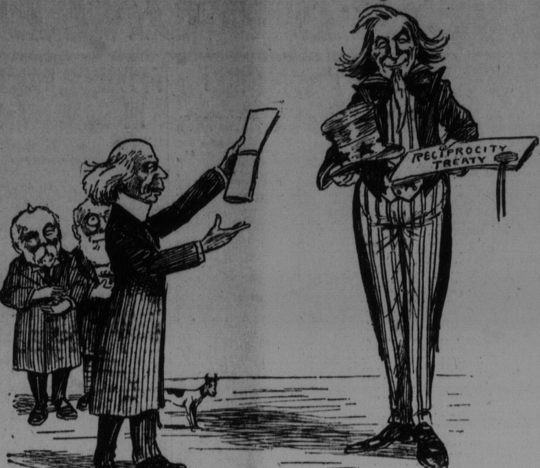
SIR WILFRID—"Here Uncle Sam won't you kindly accept the chairmanship of the Canadian Conservation Commission as a further proof of our deep devotion."

Special Low Rates Second Class DAILY MARCH 10TH TO APRIL 10TH TO British Columbia AND Pacific Coast Points