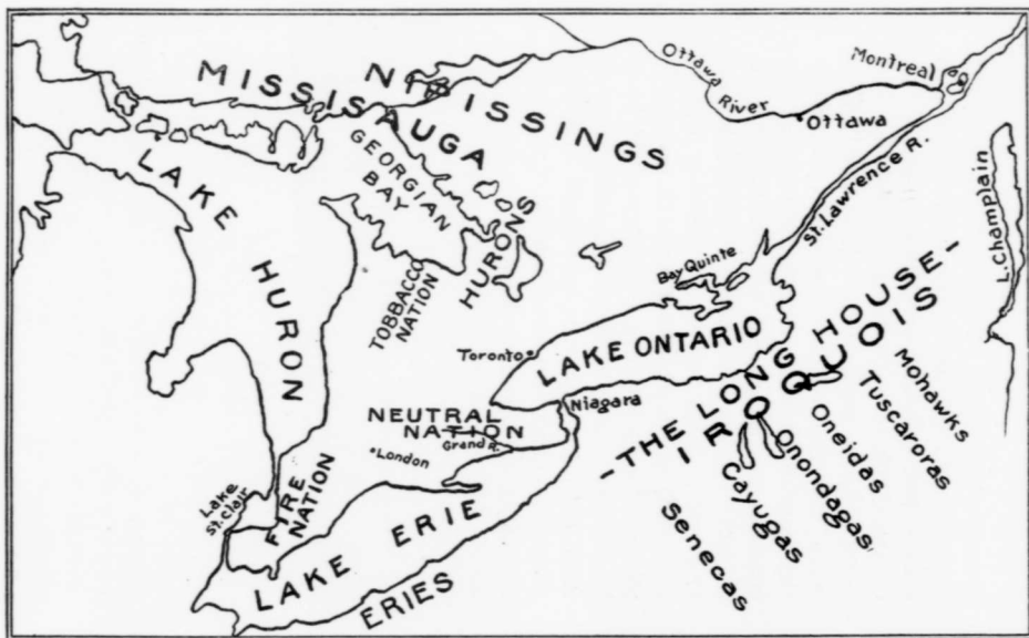
The wars of the Iroquois; the distribution of the tribes destroyed