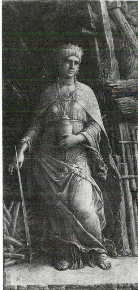
Dido (left) and Judith , works by Italian artist Andrea Mantegna (1431-1506)

About half the works in the show at Houston came from museums in France, including the Louvre.