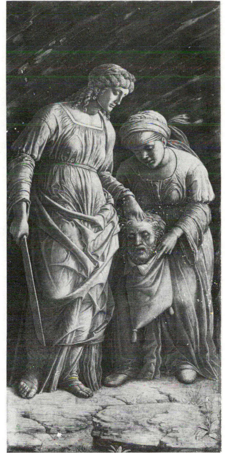
loaned by the Montreal Museum of Fine Arts to an exhibition in Houston, Texas.