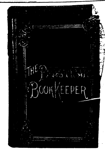
A NEW SERIES ON THE

Buy and sell Canadian and American Stocks for Cash or on Margin; also Grain and Provisions on the Chicago Board of Trade.