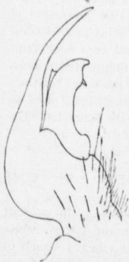
Fig. 16.— Scytonotus columbianus , sp. nov. Gonopod of male, right side, ectal view.

At once separable from S. bergrothi Chamberlin, known from Bremerton, Washington, in its obviously smaller size, which approaches more nearly that of S. granulatus Say. As in the latter species the colour is horn brown with a tendency toward reddish. The female may be distinguished in having the keels of the eighth and ninth segments of normal size or very nearly so, not absent or nearly so. The male differs in the details of the gonopods, the anterior prong, e. g., in lateral view appearing more slender and finely tapered and curving much farther beyond the end of the posterior branch,