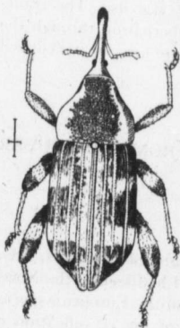
FIG. 15. Pissodes terminalis , sp. nov.

The work of this beetle was first noticed by the writer in 1907 in Kern County, California, near Cannel Mdws. at an elevation of about 7,000 feet. Later it was found distributed from the region of Mt. Whitney to Lassen County,