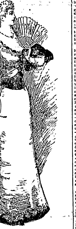
EVENING GOWN WITH STIFFENED SKIRT.