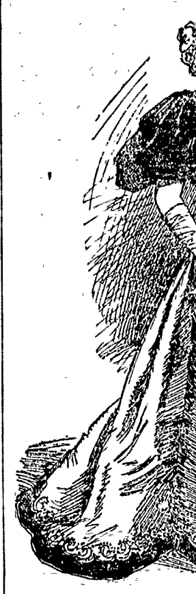
EVENING GOWN WITH STIFFENED SKIRT.