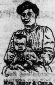
Mrs. Inhope & Child.

SOLD BY ALL DRUGGISTS. World's Dispensary Medical Association, Proprietors, BUFFALO, N. Y.