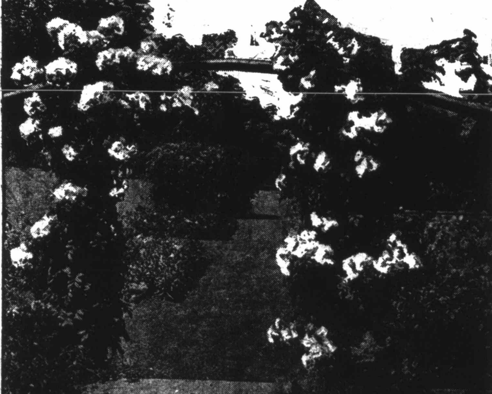
A View of Part of the Famous Bouchard