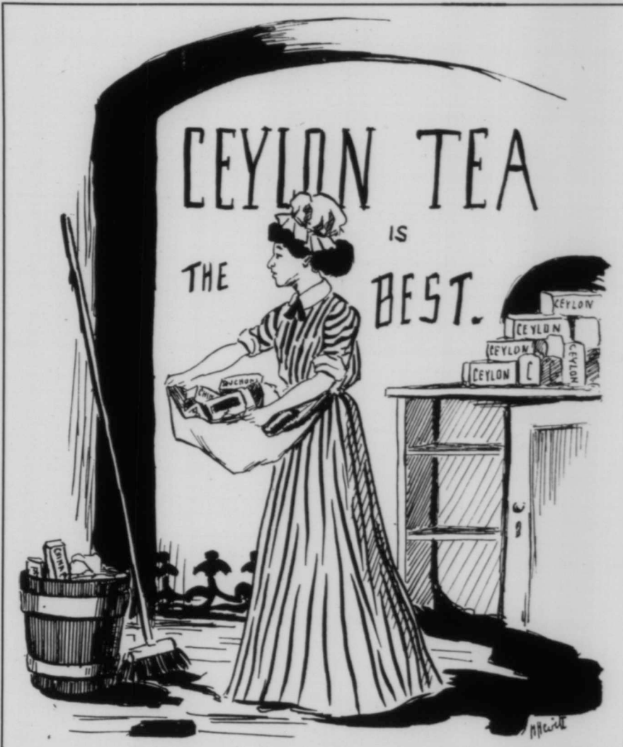
New Cook (soliloquising). Here you go, you nasty hand-rolled, messy stuff. I don't have nothing but clean, machine-made Ceylon tea in my store cupboard.