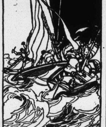
Before us loomed the black hulk of an ocean liner.

Simultaneously there rose upon the gray dawn, compounded horribly with