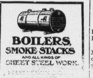
BOILERS, SMOKE STACKS AND ALL KINDS OF SHEET STEEL WORK.