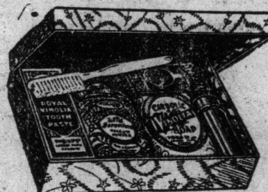
Soldiers' Comfort Box $1.00, Value $1.36

Every soldier at the front and at home should have one of these. Each box contains: 1 cake Carbolic Soap, 1c; 1 cake Helixia, Curative Soap, 3c; 1 Shaving Stick, 5c; 1 can Talcum Powder, 5c; 1 tube Tooth Paste, 2c; 1 Tooth Brush, 25c. Every article of Vinolia quality and complete, ready for mailing, for $1.00.