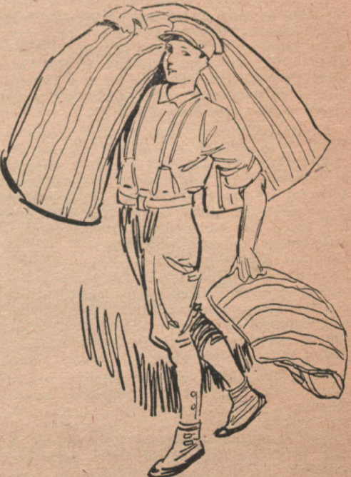
Take up thy ped and walk.

Then it falls into a half-pleading strain, and while the calls linger with the bugler, reluctant it would seem to go out to the cold, responseless expanse