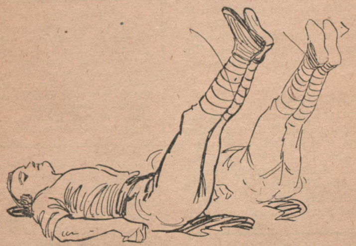
"This lying on the back, and throwing the feet towards heaven."

Nobody was to blame. They were star attractions; but they were American attractions, designed for American audiences in which the German element, it would seem, must be respected. It is galling to be dependent on alien