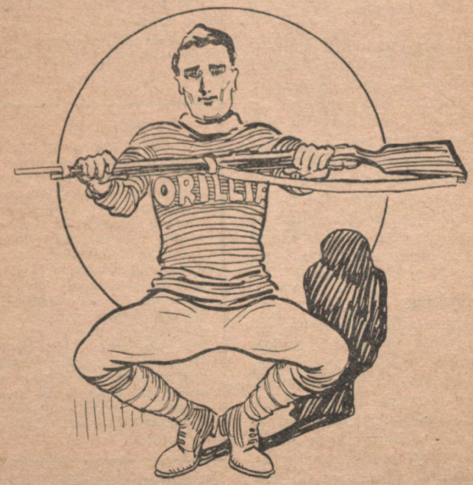
"Under his regulation coat he is free to wear what will keep him warmer than his regulation shirt will do."

"Ho! patriots," the sentinel of the Breed may call, "the Hun is upon the shore of the lov'd Motherland, and he