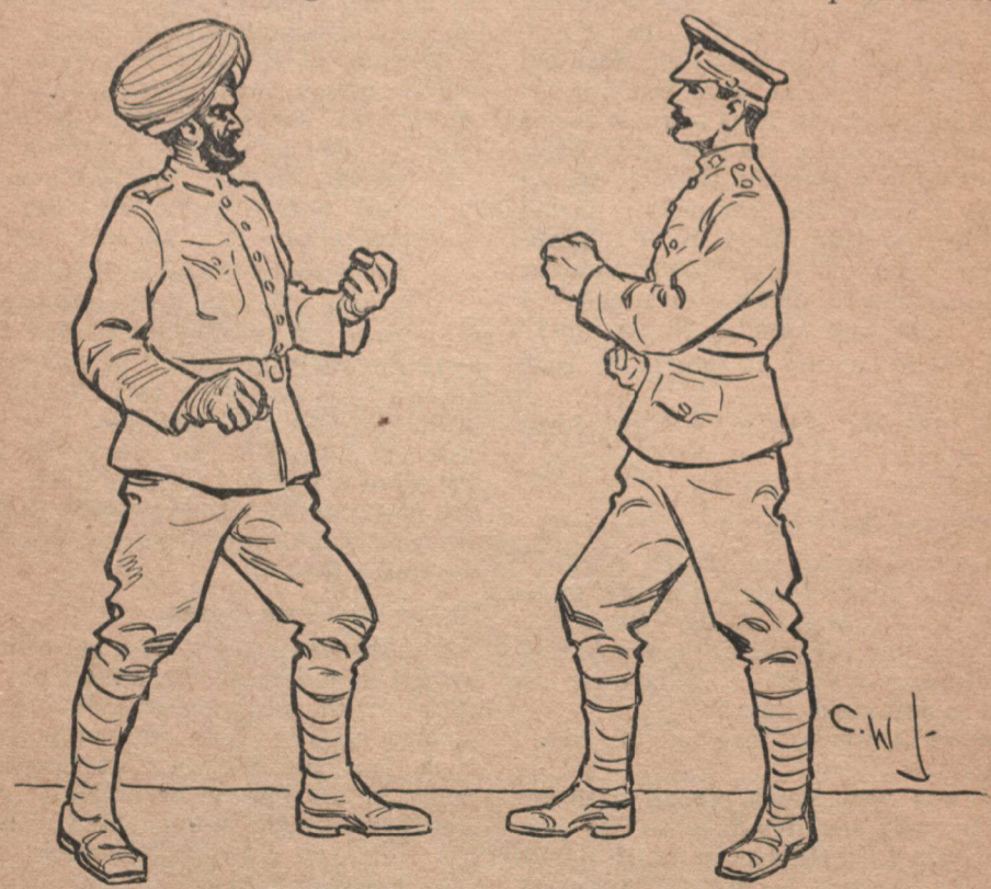
Before the War. "Keep Out."

King, can get into Canada more easily than one of the Sikhs who are dying for the Empire in France. Those questions will stand over till Germany is beaten. The beginning of the war made a great change in India itself, which you can judge for yourself if you will read some of the newspapers I will gladly bring to you.