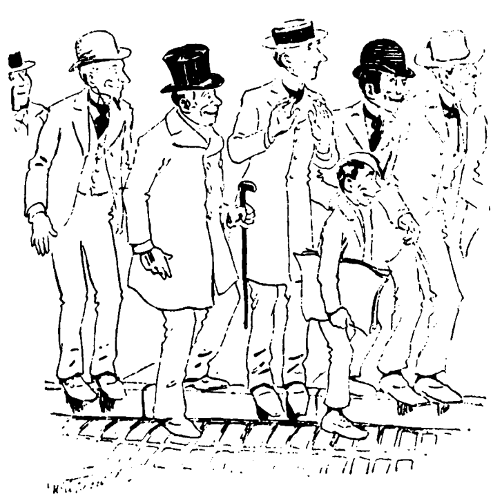
A supp shot at the fast Church Parade.

A notice was issued some time ago of a supplementary examination to be held on the 17th inst for admission to the Royal Military College, Kingston, but notwithstanding the great cost to the country the inducement held out for those seeking a military career is not sufficient to attract candidates. Not one candidate had applied for admission on the 5th, which was the last day for receiving applications. The treatment that graduates have received from the Government in the past is sufficient to warrant this state of affairs. It is understood that at present there is a scarcity of cadets.