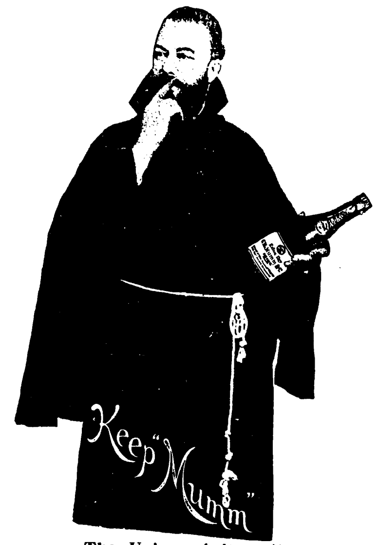
The Universal Favorite.