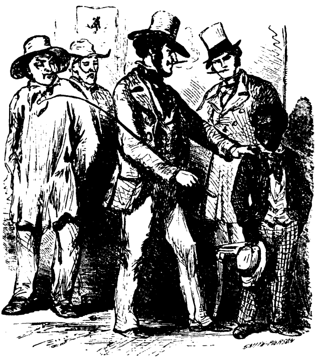
For the Sunday-School Advocate.

"How dare you give these away to people?" She only said softly, "How dare I meet Jesus if I don't do something for him?"