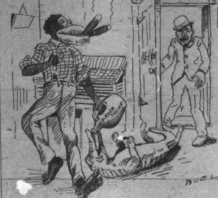
ZION SHOWS SOMNAM "DE EBILS OB'DE CUP"