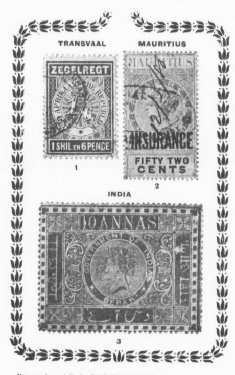
Prepared specially for THE MONTREAL PHILATELIST. By Rud lph C. Bach.

By special permission from the Post Office Authorities in Ottawa, we are allowed to publish a cut of 3 Revenues this month.