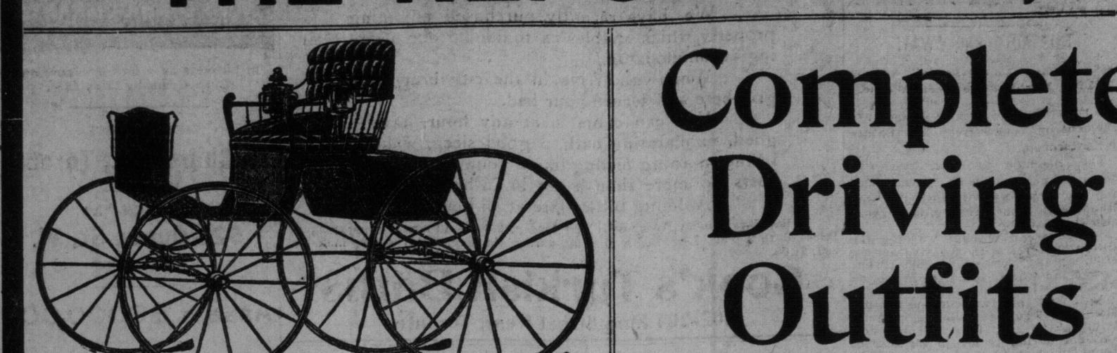
A Popular Ladies' or Gentlemen's Two Passenger Trap