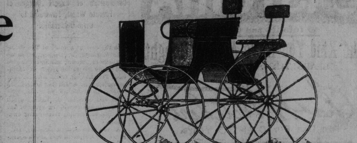
Covert Wagon—A Handy Gent's Trap.