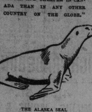
THE ALASKA SEAL